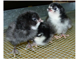
Brown Red Ameraucana